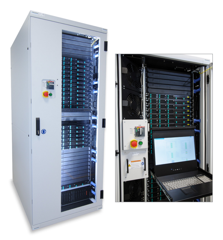
Figure 1. The Prodrive ZHPC solution can scale beyond three cabinets with 100 rack servers or more depending on the customer's network architecture.